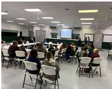
Left: Poultry Clinic

Cat Show July 16 th 1:00pm Prince of Peace