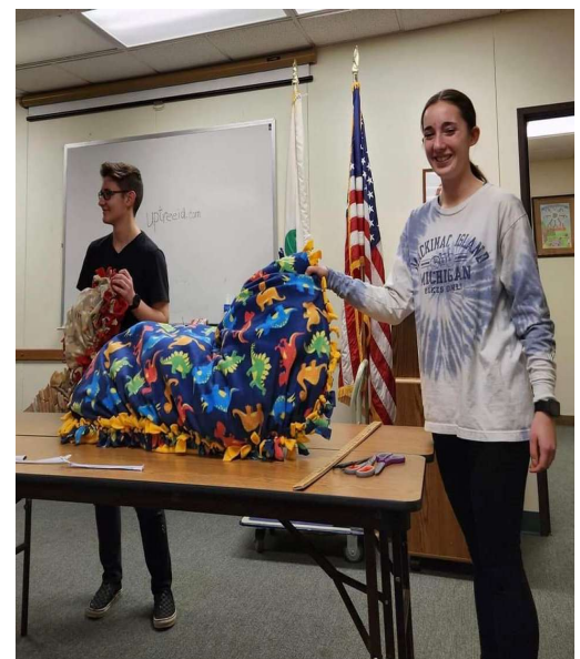
Right: Dog Board Service Project